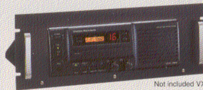
MR-3 EIA-standard 19-inch Rack