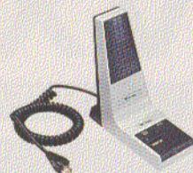
MD-11A&J Desktop Microphone